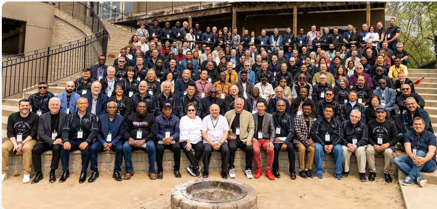
National leaders from around the world gathered for the first Senders' Summit in Alexandria, Minnesota, USA.